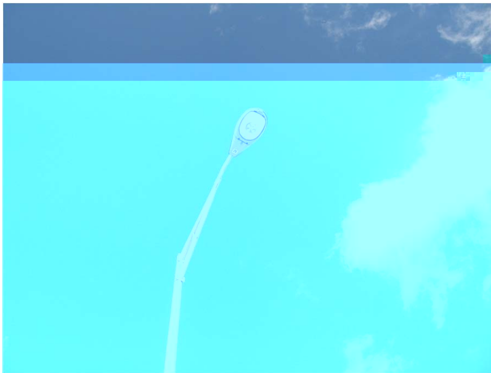
Example of Cobra Head LED Retrofit Unit (Holly Drive and West Entrance to CPT)