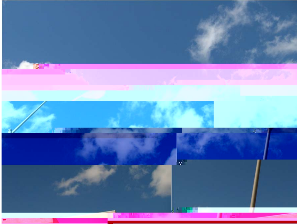
Typical Campus Cobra Head, High Pressure Sodium, Light Fixture