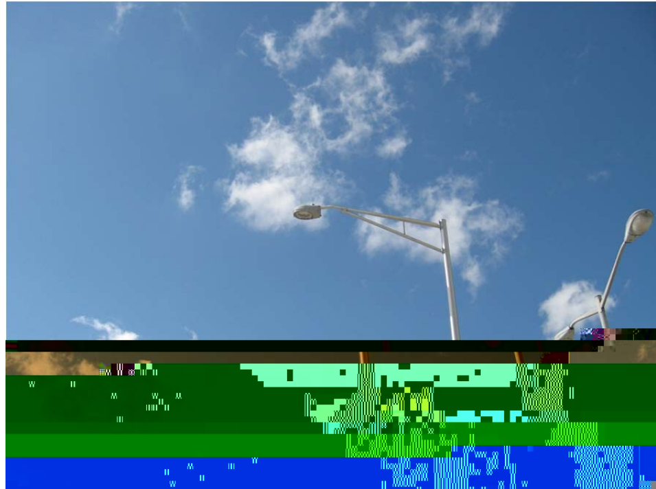
Example of LED Cobra Head Fixture (Magnolia Drive & Hawthorn Drive) (example of alternate manufactures that may be considered)