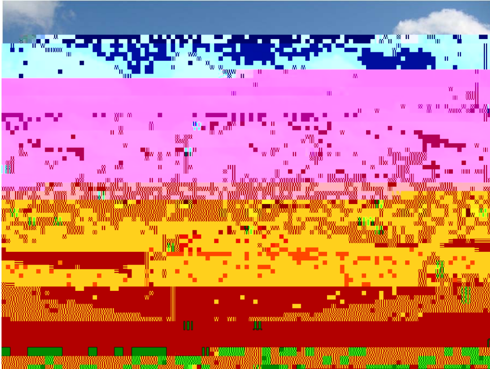
Parking Lot 6 – Northeast View