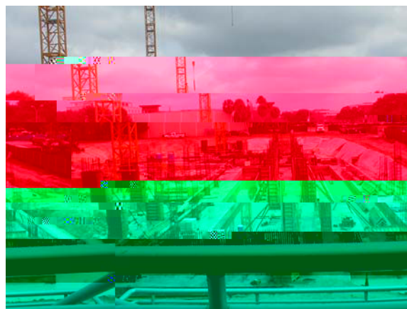
Future Seven-story Interdisciplinary Science Teaching & Research Facility (ISA). Picture taken in January from third floor of Chemistry; Administration Building is in background.