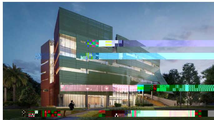
Genshaft Honors College proposed structure

that will be named the Judy Genshaft Honors College.